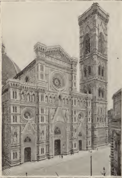
IL DUOMO AND CAMPANILE. (The Cathedral and Bell Tower of Florence.)

The brief rest sufficed to give him strength enough to re-enter on his ministry, and he announces his determination to employ his renewed powers until victory shall come. This victory he prophesies will come with his death, and reminds his hearers that death is resurrection, and not in any sense extinction, and so through death the perfected triumph shall arrive. He is ready, he affirms, to trim the lamp and keep it burning in spite of all the emissaries of Rome; that he will hold aloft the torch of truth undimmed, tho all the powers of darkness should oppose.